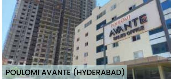
POULOMI AVANTE (HYDERABAD)