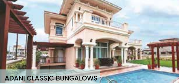
ADANI CLASSIC BUNGALOWS