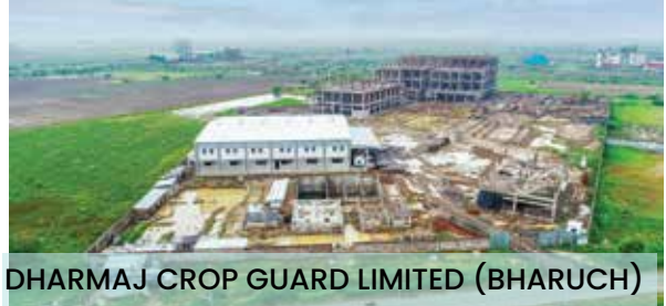
DHARMAJ CROP GUARD LIMITED (BHARUCH)