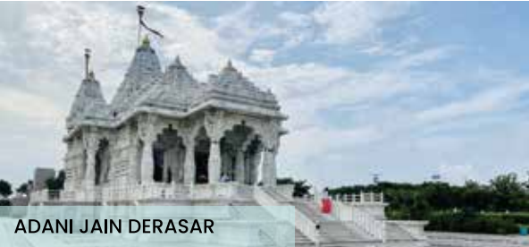
ADANI JAIN DERASAR