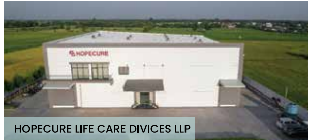
HOPECURE LIFE CARE DIVICES LLP