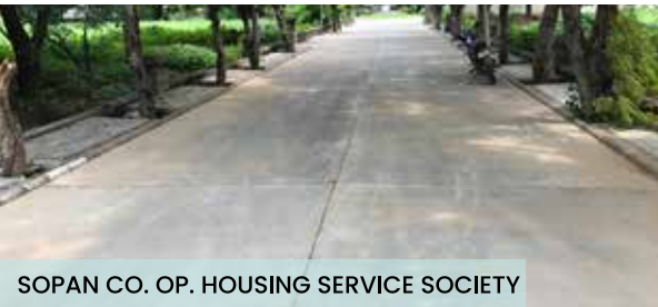
SOPAN CO. OP. HOUSING SERVICE SOCIETY