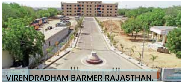
VIRENDRADHAM BARMER RAJASTHAN.