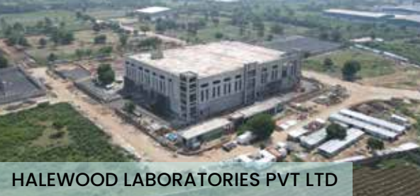
HALEWOOD LABORATORIES PVT LTD